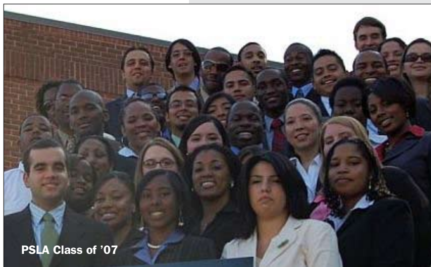
PSLA Class of '07